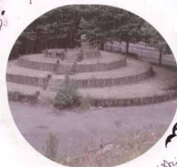
Hebs Spiral... built on existing wooden climbing spiral

How should we learn to tread more lightly on the face of the Earth? The answer is to calculate our ecological footprint, being the impact that each and everyone of us makes through our daily life styles.